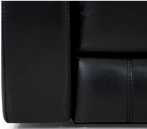
SINGLE AND DOUBLE NEEDLE TOP STITCHING